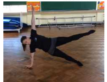
Side support 1 leg