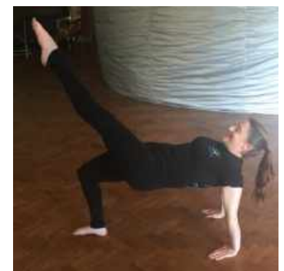
Crab 1 leg