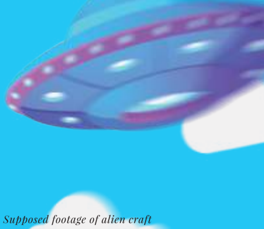
Supposed footage of alien craft